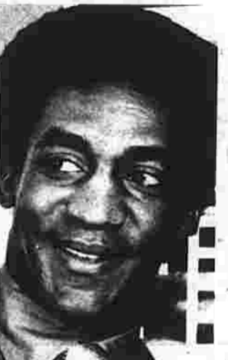
Bill Cosby stars on ABC's 'The Bill Cosby Show' 8:30-9 p.m. on Sundays.