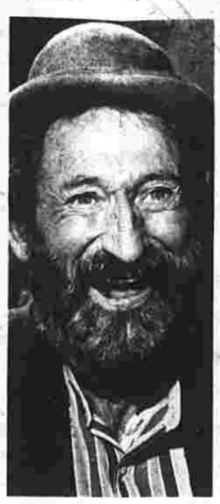
Arthur Hunnicutt on NBC's 'Bonanza' Sunday 9-10 p.m.