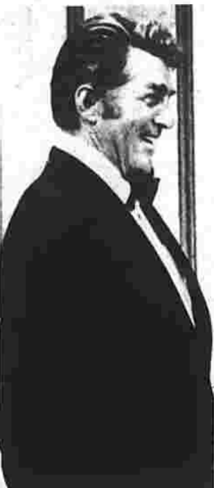
Dean Martin is on Thursday nights 10-11 p.m. on NBC.