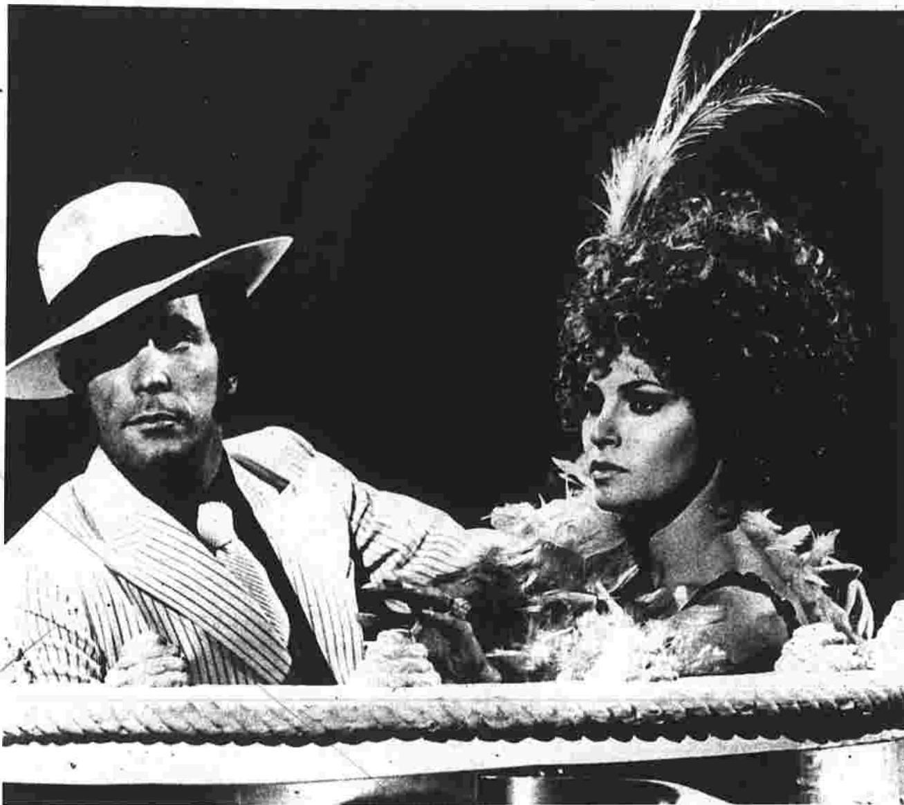
Tom Jones is a gangster and Raquel Welch his moll on ABC's "This Is Tom Jones" Thursday 9-10 p.m.

Welk boasted of his "nice, loyal, stable audience." It includes the very young—he notices the