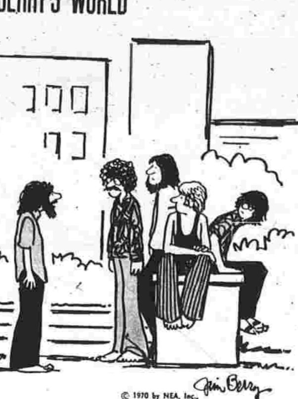
"But if we shove off our mistakes and beads and cut our hair so that we can work within the system, how will we know who's who?"