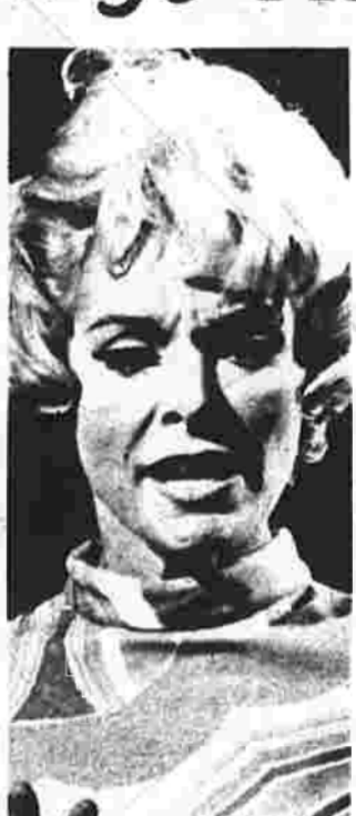
Janet Leigh stars in the film, 'Honeymoon With a Stranger' Tuesday 8:30-10 p.m.