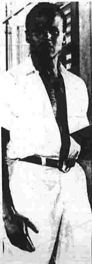
Harry Belafonte as a labor leader in the film, "Island in the Sun" Thursday 9-11 p.m. on CBS.