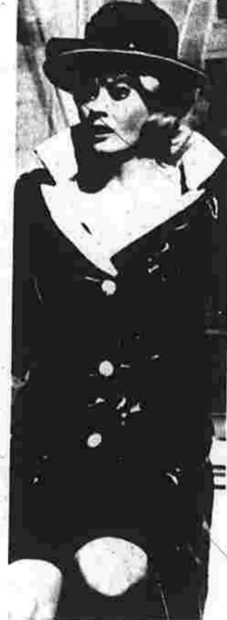
Anita Ekberg in the film, 'The Alphabet Murders' Friday 9-11 p.m. on CBS.

12:00 (3) Noon News (C) (12) Get It Together (C) (13) Dateline II (C) (14) Casper's Bowling (C) (15) Frank Atwood (C) (16) Underdog (C) (17) American Bandstand (C) (18) Un-Abridged (C) (19) Superstars (C) (20) News Report (C) (21) Family Talent Show (C) (22) Rap Around (C) (23) Jeany Quest (C) (24) Wife Working Smoking (C) (25) Reading Americans (C) (26) F Troop (C) (27) One Step Beyond (C) (28) Big 3 Theater (C) (29) Close of the China Sea (C) (30) Small party attempts to flee Japanese invasion through dangerous Philippine island jungle. David Brian.